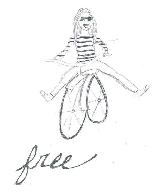
2nd Place: Olivia Klassen - 8th Grade