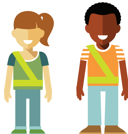
At Ease Position